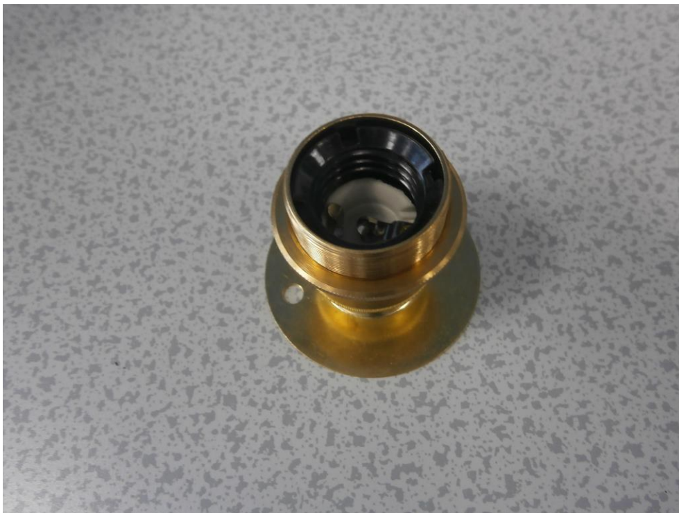
Figure 4: Lampholder model 7607ET assembled (view from lamp entry)