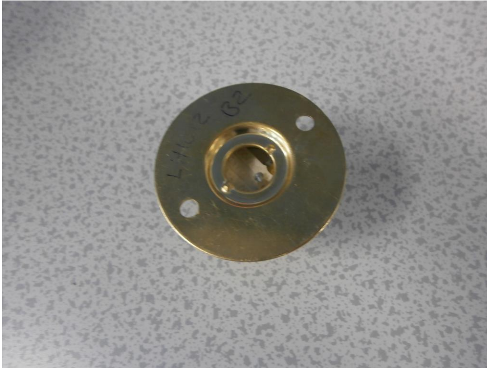
Figure 3: Lampholder model 7607ET assembled (view from cable entry)