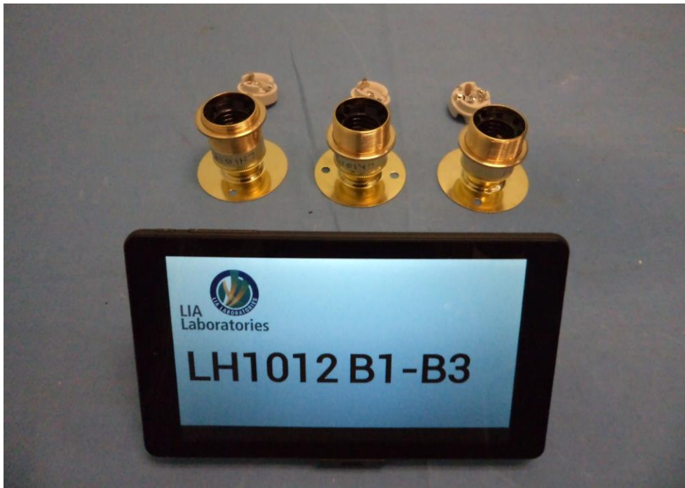
Figure 1: Lampholder model 7607ET (Test samples B1 – B3)