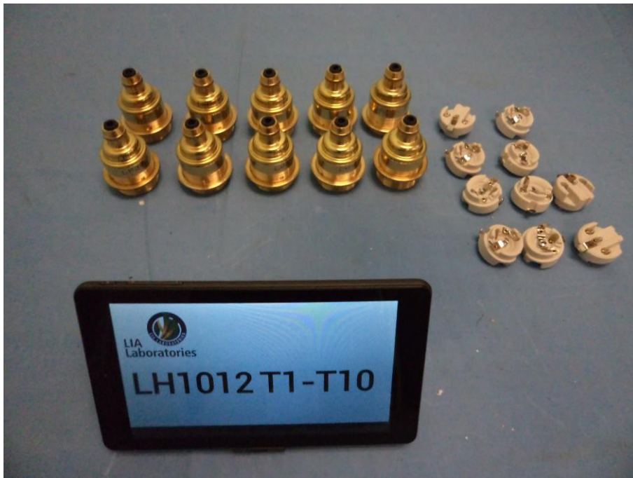
Figure 1: Lampholder model 7600ET (Test samples T1 – T10)