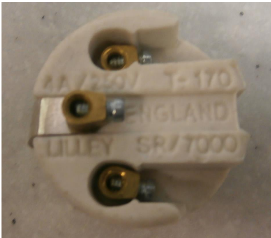
Figure 2: Ceramic insert