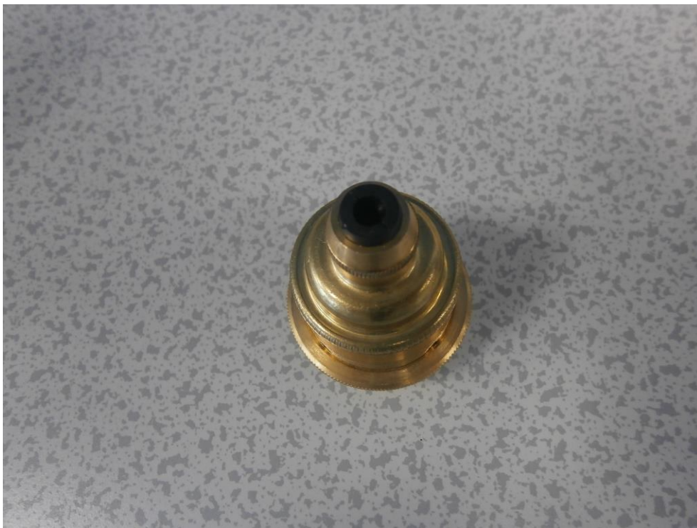
Figure 4: Lampholder model 7600ET assembled (view from cable entry)