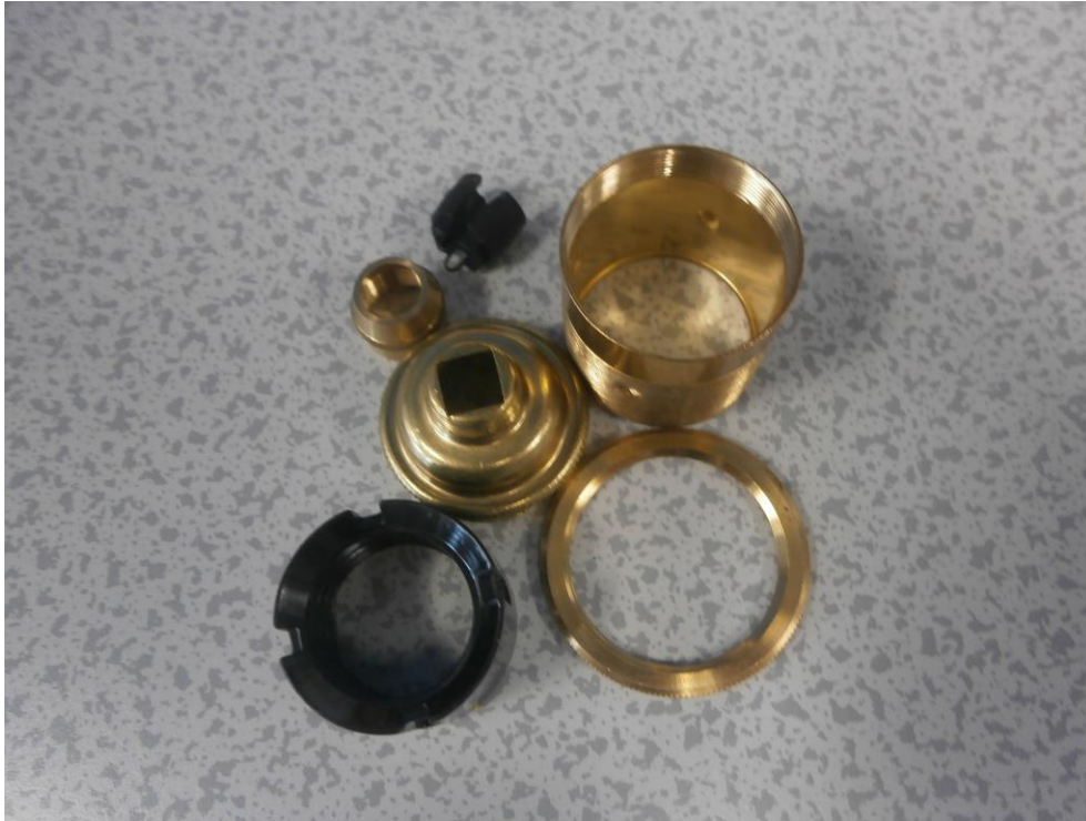
Figure 3: Lampholder model 7600ET components