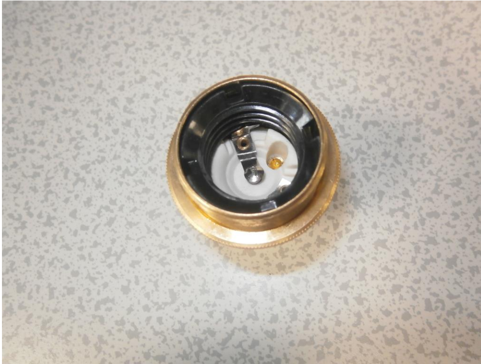
Figure 5: Lampholder model 7600ET assembled (view from lamp entry)